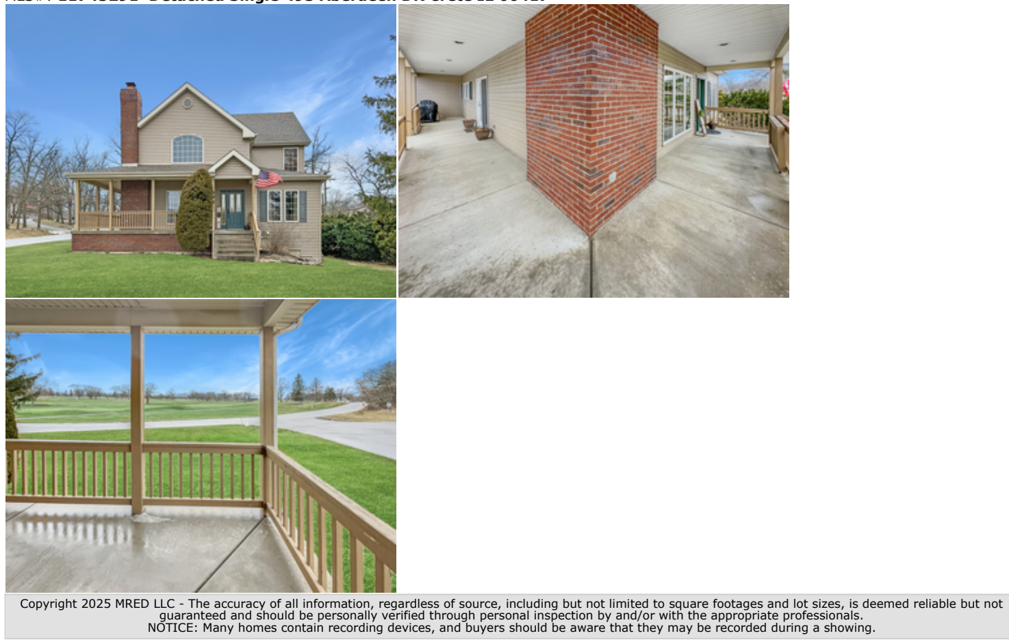
MLS#: 11743291 Detached Single 493 Aberdeen DR Crete IL 60417