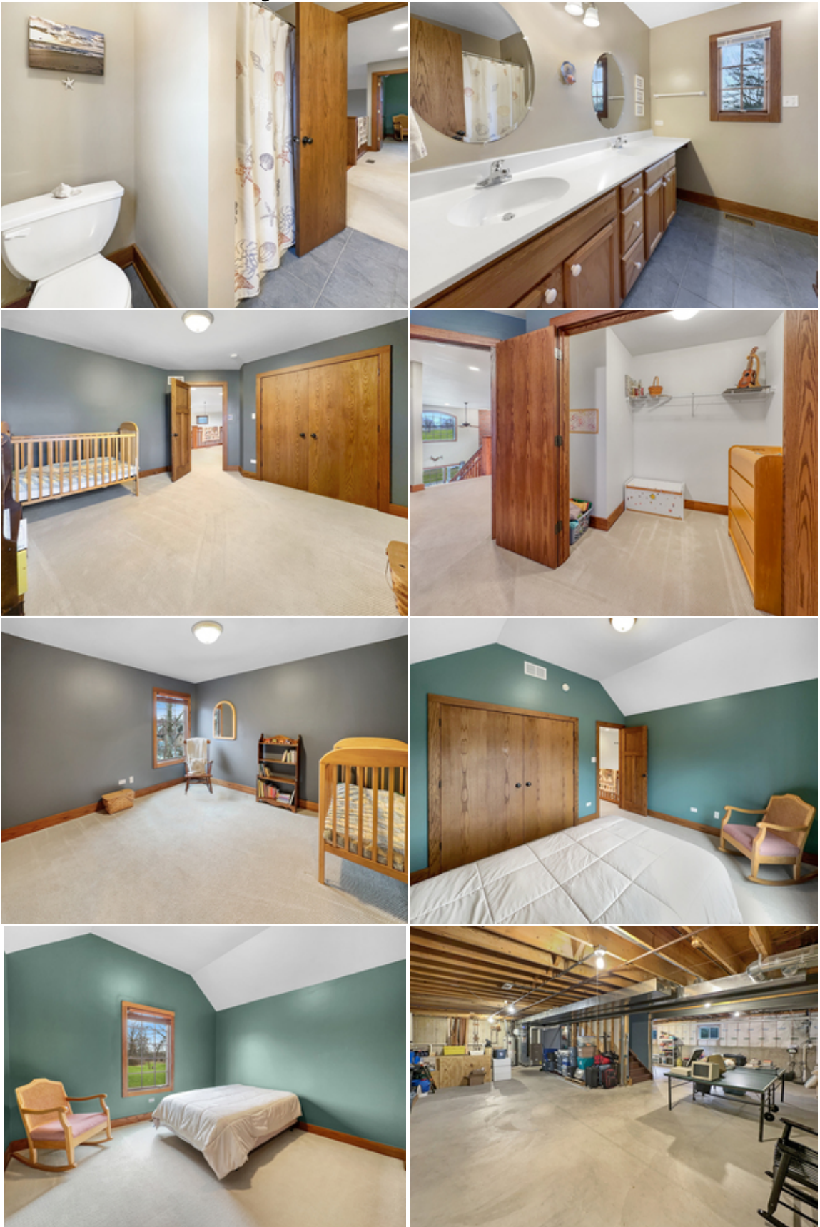
Copyright 2025 MRED LLC - The accuracy of all information, regardless of source, including but not limited to square footages and lot sizes, is deemed reliable but not guaranteed and should be personally verified through personal inspection by and/or with the appropriate professionals. NOTICE: Many homes contain recording devices, and buyers should be aware that they may be recorded during a showing.