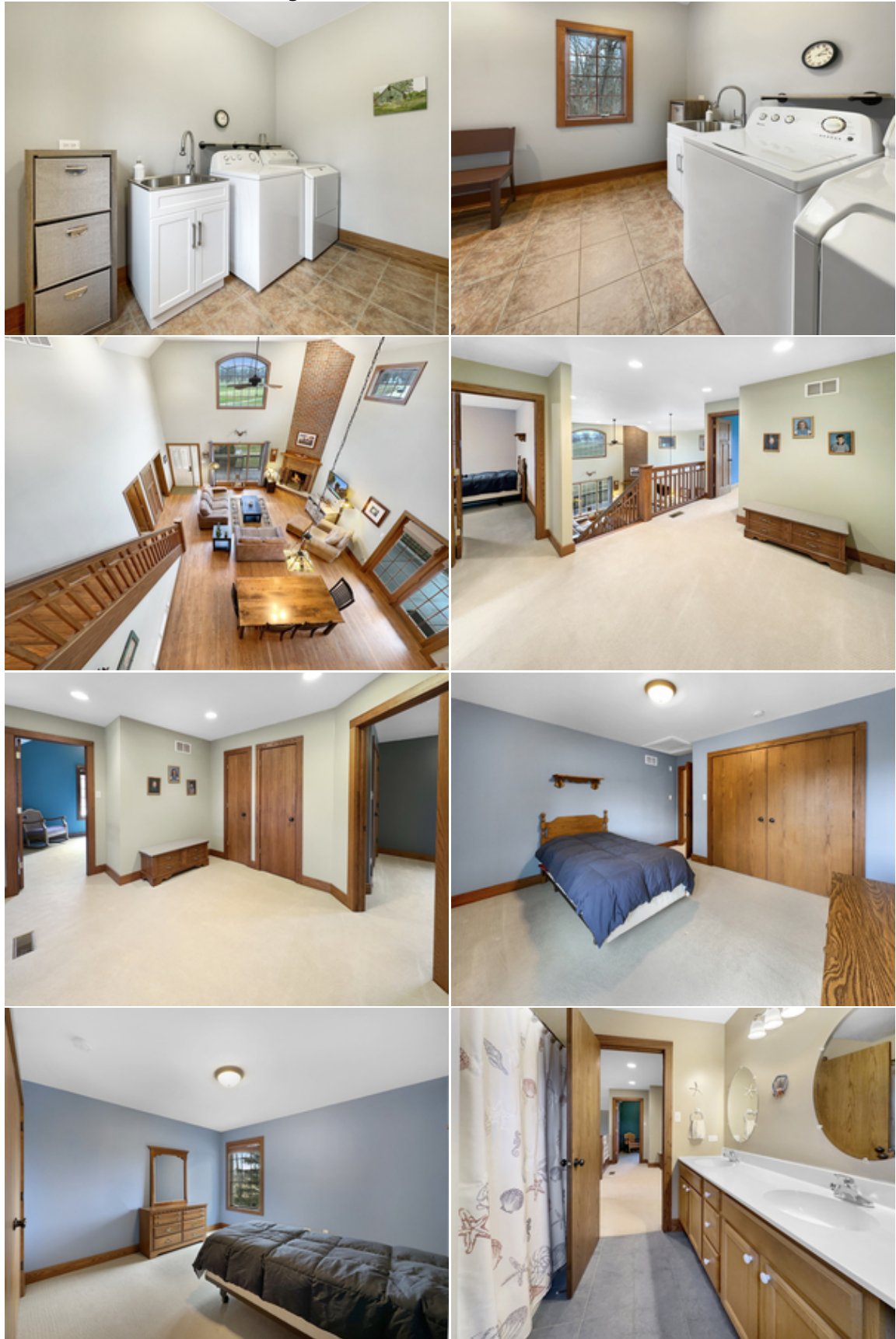
Copyright 2025 MRED LLC - The accuracy of all information, regardless of source, including but not limited to square footages and lot sizes, is deemed reliable but not guaranteed and should be personally verified through personal inspection by and/or with the appropriate professionals. NOTICE: Many homes contain recording devices, and buyers should be aware that they may be recorded during a showing.