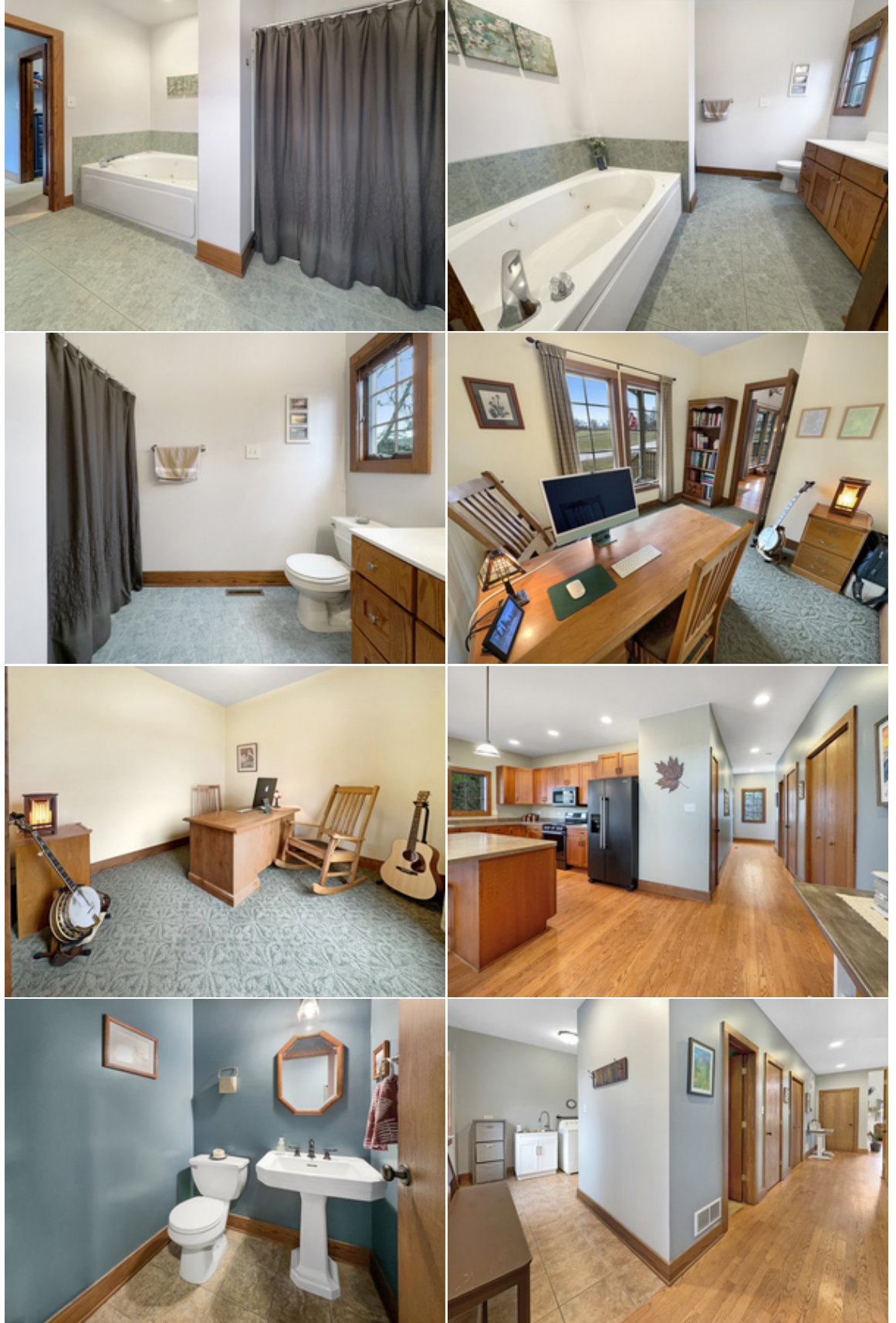
Copyright 2025 MRED LLC - The accuracy of all information, regardless of source, including but not limited to square footages and lot sizes, is deemed reliable but not guaranteed and should be personally verified through personal inspection by and/or with the appropriate professionals. NOTICE: Many homes contain recording devices, and buyers should be aware that they may be recorded during a showing.